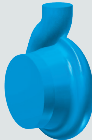
Patented axial spiral

channels that the solids have to pass through nor are there any radial gaps between the pressure and suction sides that could be clogged by fibers and otherwise obstruct the pump.