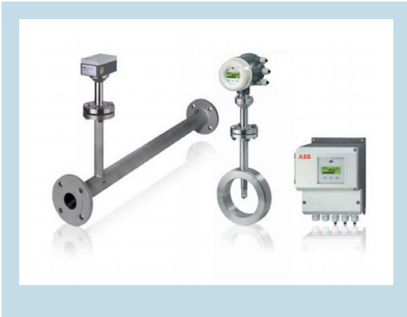
The Sensyflow FMT500-IG product family for thermal mass flow measurement

because Sensyflow directly measures the mass flow. However, in case of volume mass flow meters a density correction is required, causing an increase of system error and also additional cabling and mechanical installation expenses. Similar to all other flowmeters, device-specific smoothing sections must be foreseen before the device. In case this is not possible for reasons related to the system, a calibration can be performed